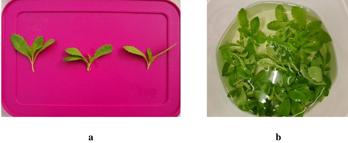
Figure 1. Shoot tips: a= shoot tips taken from seedlings b= immersion of shoot tips in colchicine solution